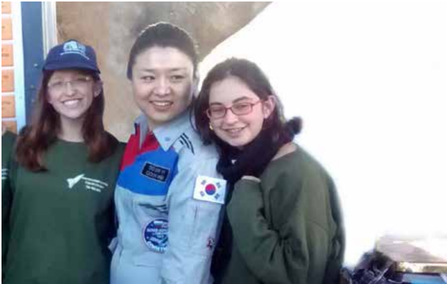
Yi So-yeon (center) and two members of the winning class from the Pelech Religious Experimental High School for Girls

Over 400 classes entered the competition in memory of Israeli astronaut Ilan Ramon